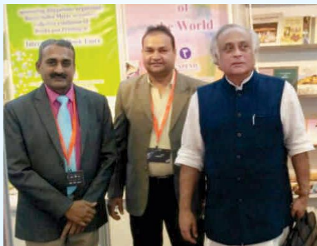
Ex- MOS for Commerce & Industry Shri Jairam Ramesh visited CAPEXIL 's Stall at Sharjah International Book Fair , 2017, appreciated that CAPEXIL is doing a good job for promoting Indian exporters (Book Publishers, Printers, etc.) participation in the overseas Fairs.