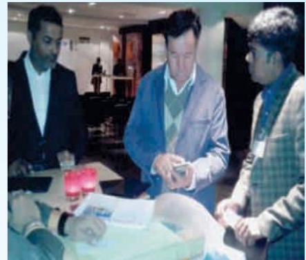
CAPEXIL Delegate interacting at the Inauguration Function of B2B Event at Amsterdam, Netherlands B2B Meet in progress with Importer by CAPEXIL Delegates at B2B Event at Amsterdam, Netherlands