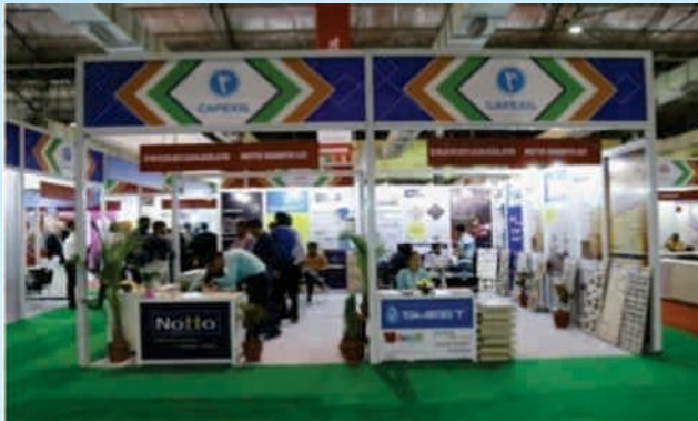
Stalls put up by the members of CAPEXIL at the CAP INDIA Expo 2018, Mumbai