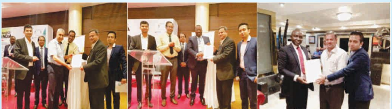
CAPEXIL signed MOU with Indian Professional Forum (IPF), Nigerian Association of Chambers of Commerce, Industry, Mines and Agriculture (NACCIMA) & Lagos Chamber of Commerce & Industry at Source India Show, Lagos, Nigeria during 27th -29th March, 2018 to promote trade and bilateral relations between the two economies.