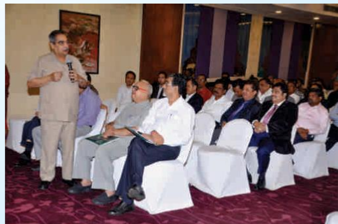
A Cross Section of the Audience at the 59th AGM of CAPEXIL