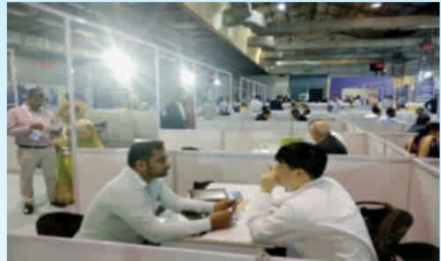
B2B Meetings are in progress at the CAP INDIA Expo 2018, 22nd-24th March, Mumbai