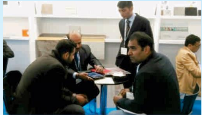
B2B Meet with Importers by CAPEXIL Exhibitor at the INDIA Pavilion, The Flooring Show'2017, U.K.