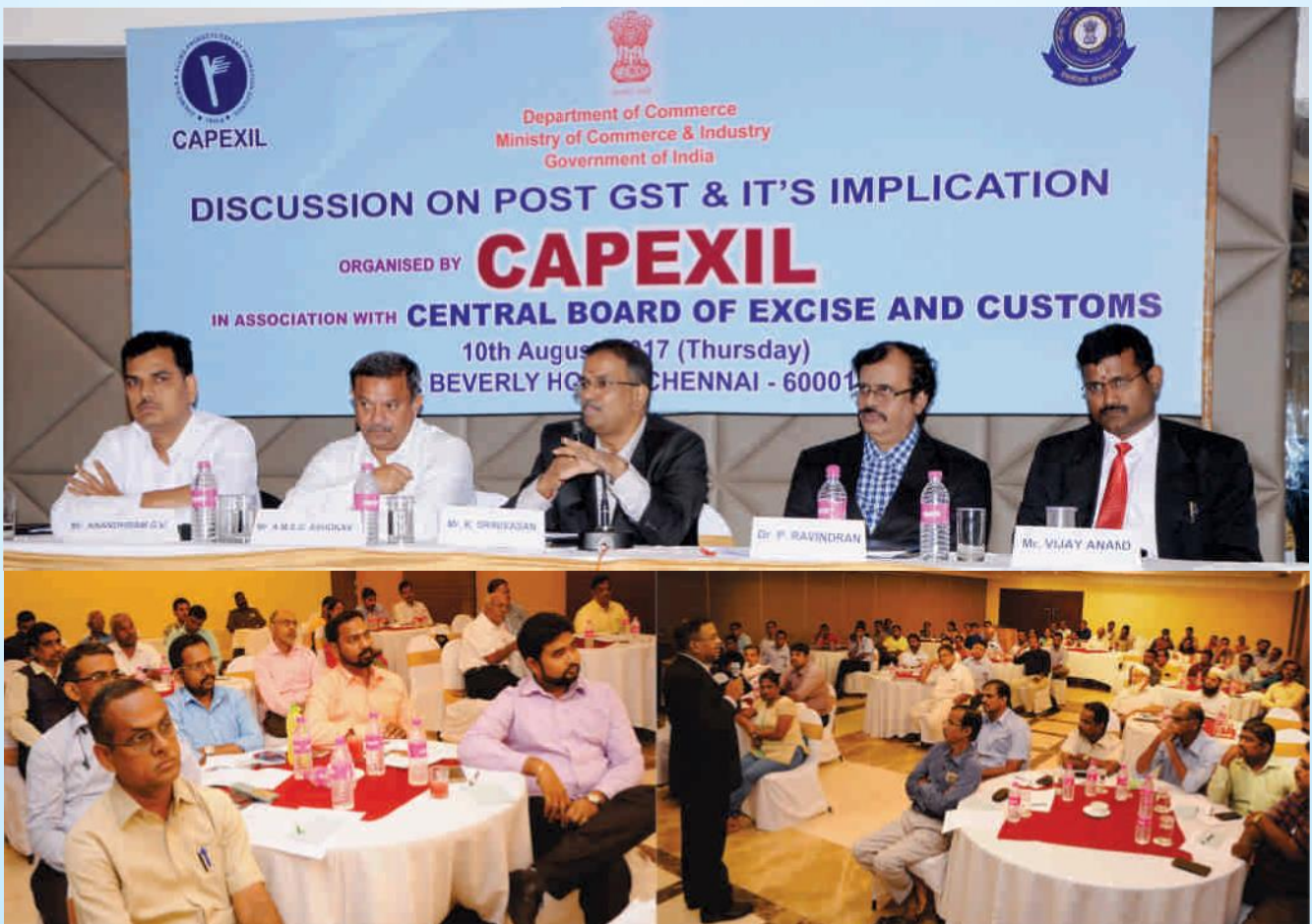
Section of Member Exporters / Attendees of CAPEXIL Export Awareness Seminar with Focus on Post GST & Its implication held on 10th August, 2017 at Chennai.